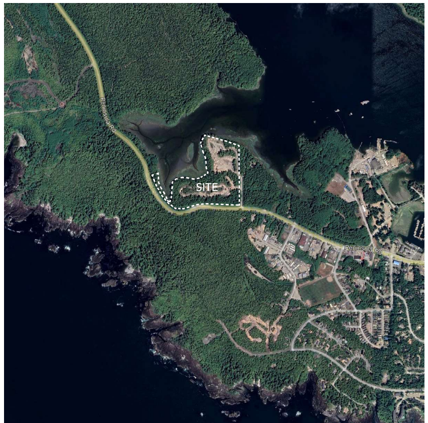
SATELLITE VIEW OF CONTEXT AROUND SITE